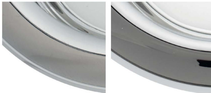
satin nickel / chrome